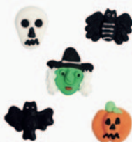
SP Assorted Halloween Sugar Pippings