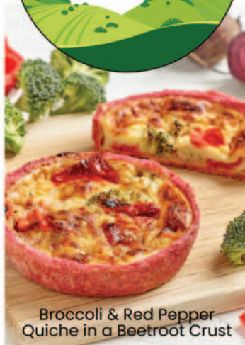
Broccoli & Red Pepper Quiche in a Beetroot Crust