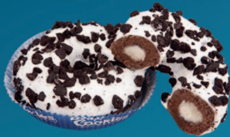
273395 Stocksons Cookie Doughnut