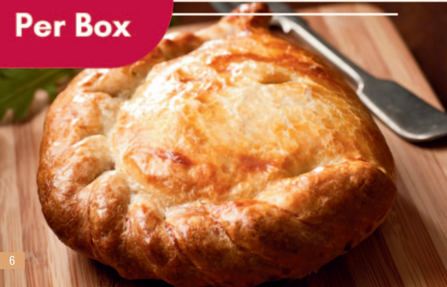
Steak & Stilton Pasty