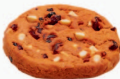
SP Europastry Halloween Cookie