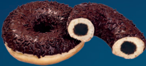
270755 Stocksons Triple Chocolate Doughnut