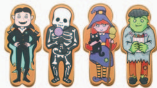
SP Halloween Gingerbread Men Sugar Plaques