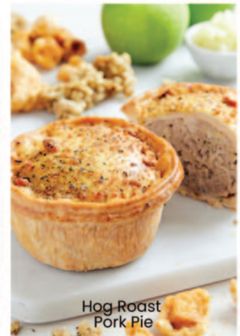
Hog Roast Pork Pie