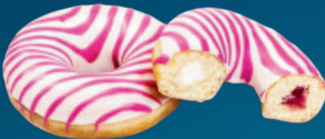
273385 Stocksons Panna Cotta Doughnut