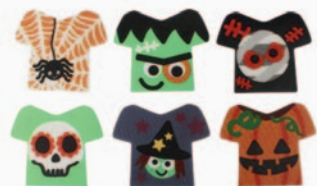
SP Halloween Jumper Sugar Plaques