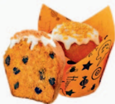
SP Europastry Halloween Muffin