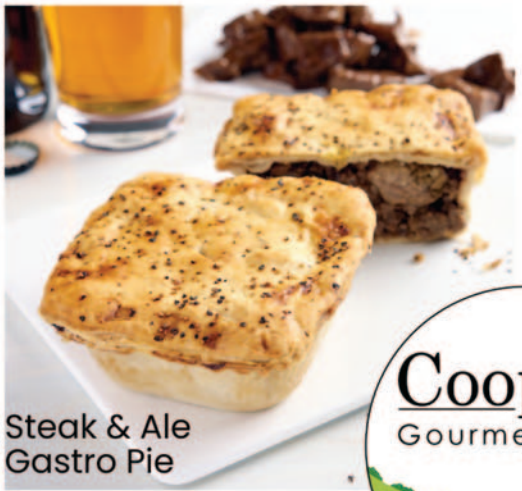
Steak & Ale Gastro Pie