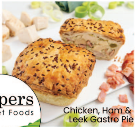
Chicken, Ham & Leek Gastro Pie