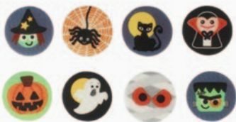
SP Spooky Halloween Sugarettes