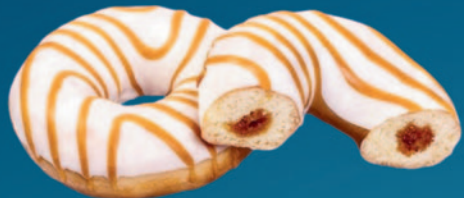
273393 Stocksons Caramellove Doughnut