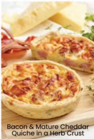
Bacon & Mature Cheddar Quiche in a Herb Crust