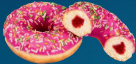
273383 Stocksons Strawberry Filling Doughnut